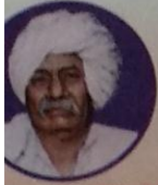
Vitthalrao Vikhe Patil (Admashri Awardee)