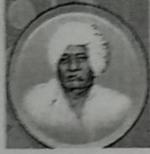
Late Dr. Vitthalrao Vikhe Patil (Padmashri Awardee)

Pravara Rural Education Society's COLLEGE OF ARCHITECTURE At-Mohu, Post-Chincholi, Tal-Sinnar, Dist-Nashik Pin -422102 Phone: (02551)271161, 271278, Fax:271277 Email:-pravaramohuarchitecture@rediffmail.com Website: www.svitnashik.in Affiliated to University of Pune Letter No:CA/7192, Dt:30/6/2014 Approved by Council of Architecture, New Delhi Letter No:CA/5/MH68, Dt:14/5/2013 University ID NO: PU/NS/Arch/169/2014